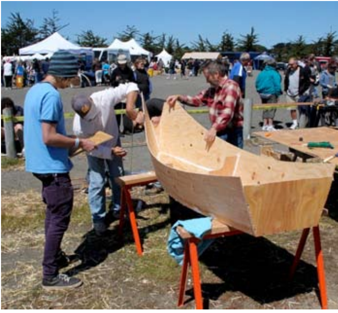
Wood Ducks II team nearing completion

The remarkable thing is that he screwed the plywood sides (one thickness) right into the bottom; no furring strip at all, just plywood butted and screwed into plywood, a fair amount of caulk, and some bracing. They wisely left a bit of margin for themselves in attaching the plywood, enough to trim back with saws and block planes. But the thing held well enough for Dan, who is lean and tough, to paddle kayak-style and come in first at the finish line, a good four lengths ahead of the nearest competitor. Kudos to both of them. Tom said that he thought the boat should last about as long as maybe a Dixie Cup, and by any measure, he succeeded.